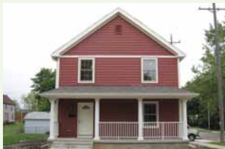
1300 Franklin Street