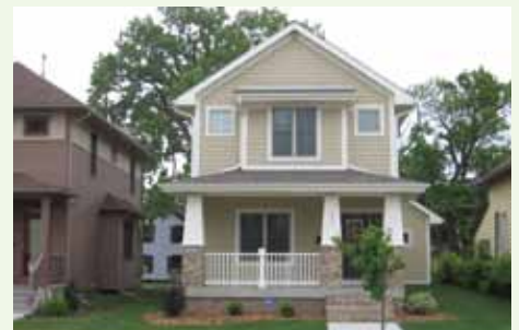
1211 Racine Street