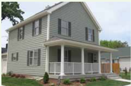
1652 Mead Street

The homes pictured below have been built by Neighborhood Housing Services to help revitalize the Towerview neighborhood. For more information please contact NHS at 262-633-3330.